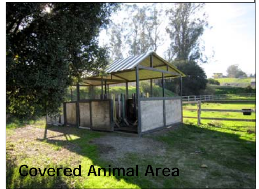
Covered Animal Area

Very private 4.60 acre former horse training facility with a six stall barn, paddocks, two outbuildings, fenced pasture, plus two additional barns and a detached three car garage. Property features a vintage two bedroom home, country kitchen, with high ceilings, double hung windows and period detailing. Sprauer Road is a lovely one of a kind rural road; what a great opportunity to own some land in the country for you, your horses, pets and farm animals.