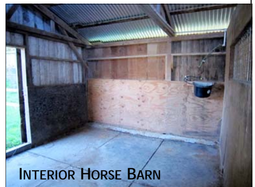
INTERIOR HORSE BARN